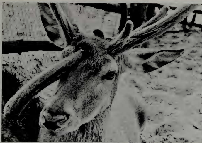
Fig. 7. Red deer stag Jasio. Picture taken on August 3rd, 1962. A broken, frontal graft, hanging on the skin and a small parietal graft are visible

seen, the time of velvet shedding changed very little from year to year. As a rule the velvet shedding from the parietal graft occurred later, than from the operated antlers. It is also interesting, that the parietal graft was mostly cast earlier, than the other antlers. It is an argument proving that the greater weight of an antler does not accelerate the casting.